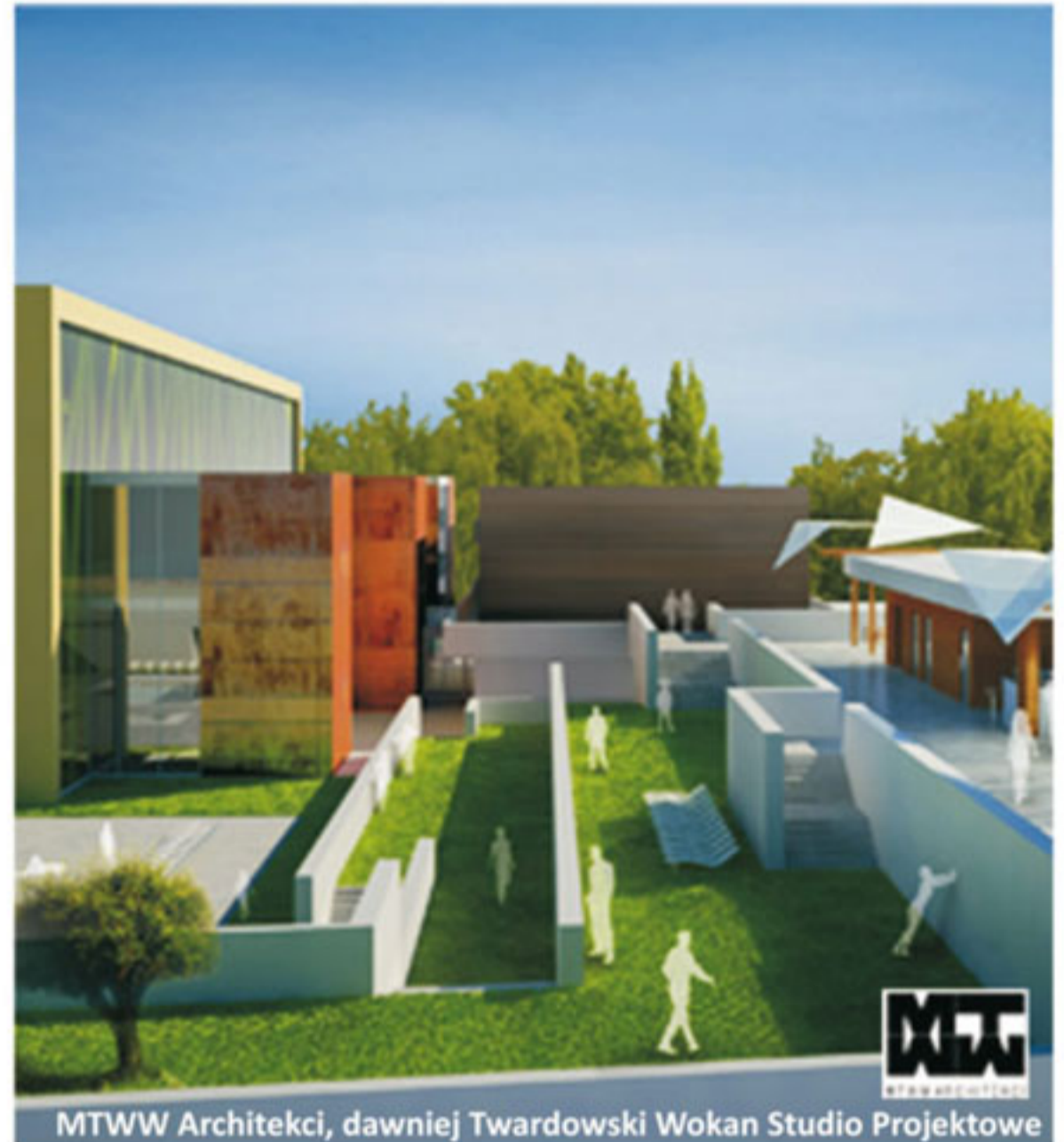
MTWW Architekci, dawniej Twardowski Wokan Studio Projektowe