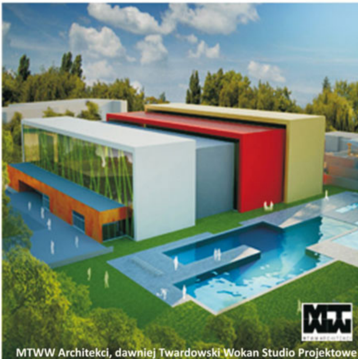
MTWW Architekci, dawniej Twardowski Wokan Studio Projektowe