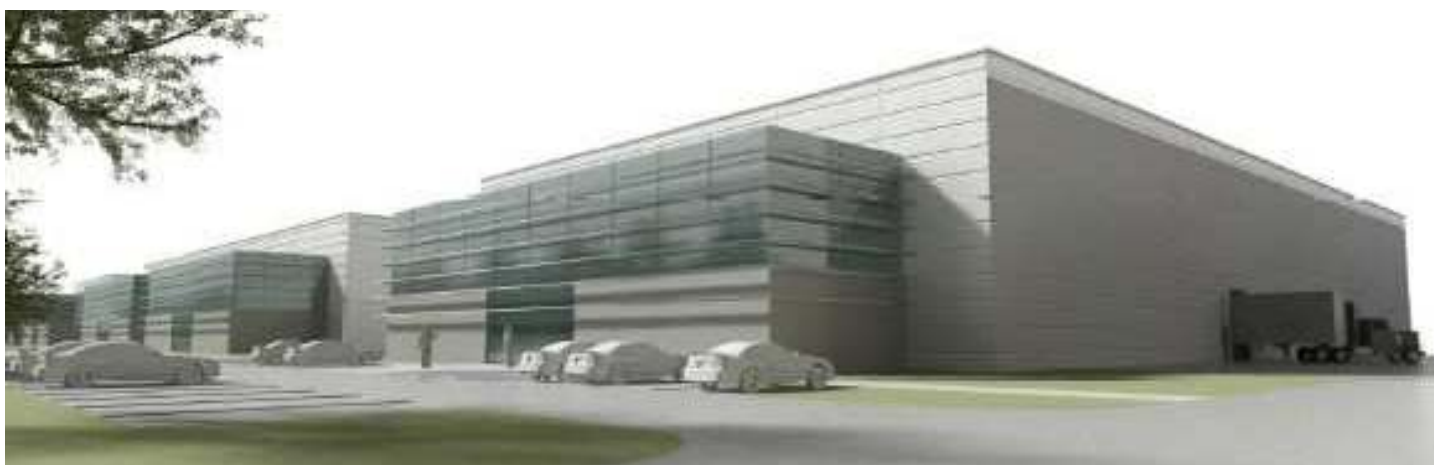
Visualisations of the complex located at ul. Nad Drwiną

In order to receive detailed information, please contact: