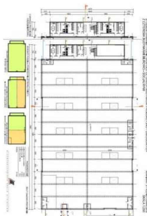
Plans of one of four construction objects

Buildings adjoining production/services halls Two-storey: ground floor – social rooms, first floor – offices Office area: ca. 130 m 2 in each building Office area: ca. 200 m 2 in each building Possibility of expansion (second floor)